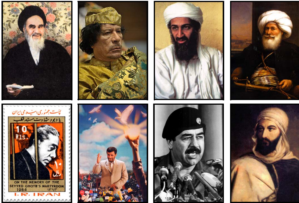
From left to right, top : Imam Khomeini (1902-1989); Muammar Gaddafi (1942-2011†); Osama bin Laden (1957-2011†); Muhammad Ali Pasha (1769-1849). Bottom: Sayyid Qutb (1906-1966†, here shown in jail on an Iranian stamp from 1984!); Mahmoud Ahmadinejad (1956- ...); Saddam Hussein (1937-2006 †); Emir Abdelkader (1808-1883). († = assassinated!)

Pan-Arabism and Pan-Islamism, Sunnis and Shiites, same Resistance against the Barbaric/Heathen Western World !