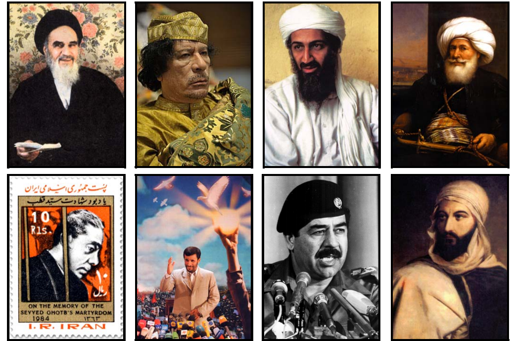
From left to right, top : Imam Khomeini (1902-1989); Muammar Gaddafi (1942-2011†); Osama bin Laden (1957-2011†); Muhammad Ali Pasha (1769-1849). Bottom: Sayyid Qutb (1906-1966†, here shown in jail on an Iranian stamp from 1984!); Mahmoud Ahmadinejad (1956- ...); Saddam Hussein (1937-2006 †); Emir Abdelkader (1808-1883). († = assassinated!)

Pan-Arabism and Pan-Islamism, Sunnis and Shiites, same Resistance against the Barbaric/Heathen Western World !